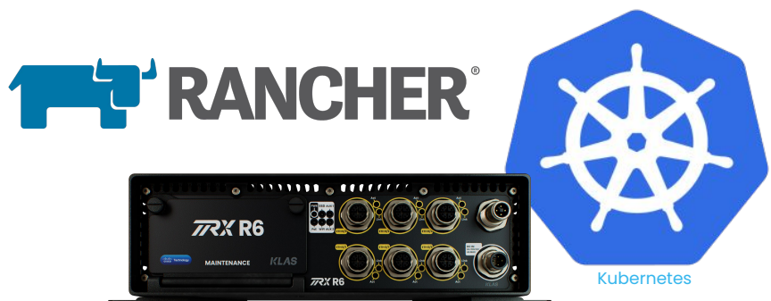
Figure: TRX R6 supports containerization with Rancher and Kubernetes.

However, supporting containers at the edge, and in particular on trains, requires an open EN compliant compute architecture that can be securely managed from anywhere.