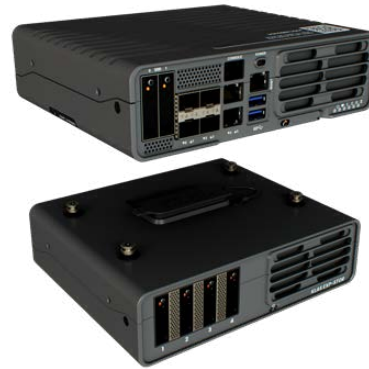
VoyagerVM 4.0 and Storage Expansion Module