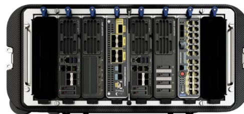
Voyager 8+ With VoyagerGPU 4.0 and VoyagerNAS 4.0

The configuration shown here features a Voyager 8+ chassis with a VoyagerGPU 4.0, VoyagerSW12GG, VoyagerNAS 4.0, and VoyagerSW26G installed.