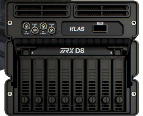
TRX D8 2.0 base storage module

TRX D8 2.0 allows the base storage unit to be used as a PCI- or network-based logger by simply swapping the head unit for a PCIe Target Adapter or compute unit. Example deployments are as follows: