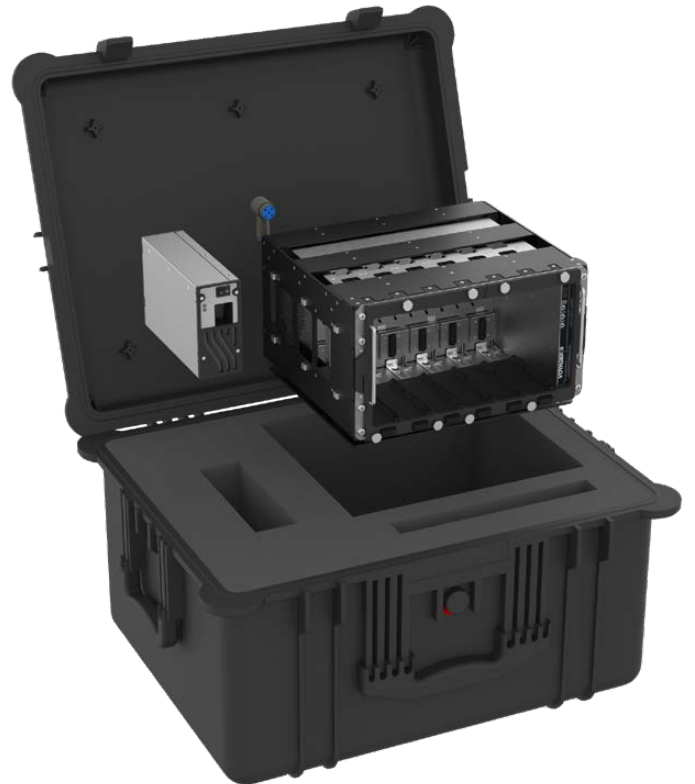
Optional Desktop Kit